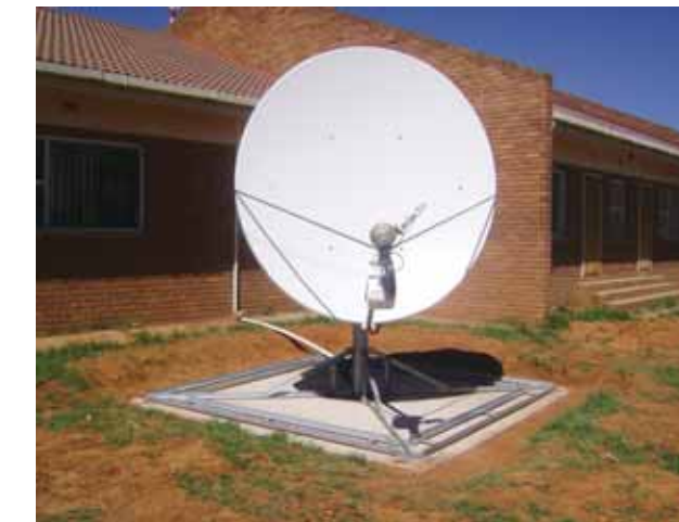
A 2,4 m dish recently installed in Sandvet. Consideration will be given to the secure placing of satellite dishes at all times.

More information on the implementation of the Project will be published in the next edition of computek connect .